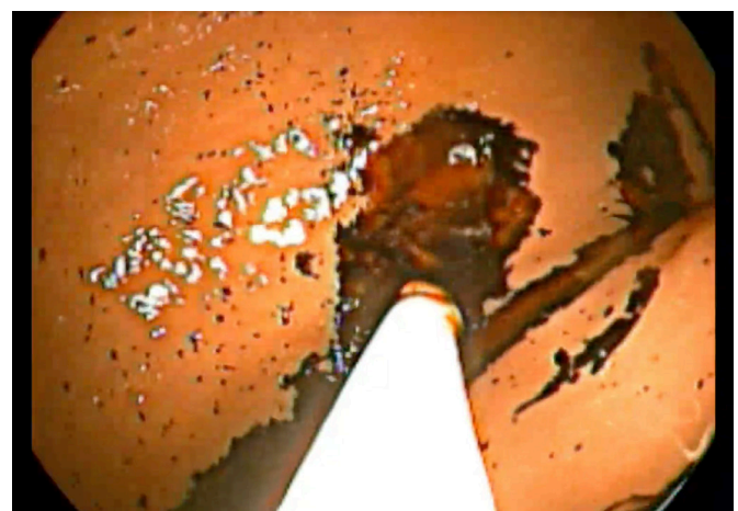
Figure 2 Congo red changes its colour from red to dark blue or black in an acidic environment.

While performing the routine OGD, the following sequence of steps are taken. The physician inserts a gastro-scope into the patient's upper digestive area to check the mucosa of the stomach and duodenum to determine if there are cancerous or non-cancerous lesions. A small tube is then inserted through the instrument channel of the gastro-scope to protrude into the stomach area. A 10cc syringe containing Congo red paint is sprayed through the rubber tube on the gastric mucosa in the body of the stomach. Through visual identification, any colour change of the gastric mucosa is identified. The diagnostic criterion for AC is no change in the colour of Congo red (figure 1). If Congo red is exposed to acidic conditions, the colour will change from red (pH 5.0) to dark blue or black (pH 3.0) (figure 2; online supplemental videos 1 and 2, respectively).