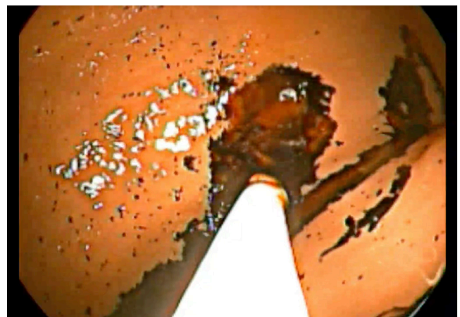
Figure 2 Congo red changes its colour from red to dark blue or black in an acidic environment.

While performing the routine OGD, the following sequence of steps are taken. The physician inserts a gastro-scope into the patient's upper digestive area to check the mucosa of the stomach and duodenum to determine if there are cancerous or non-cancerous lesions. A small tube is then inserted through the instrument channel of the gastro-scope to protrude into the stomach area. A 10cc syringe containing Congo red paint is sprayed through the rubber tube on the gastric mucosa in the body of the stomach. Through visual identification, any colour change of the gastric mucosa is identified. The diagnostic criterion for AC is no change in the colour of Congo red ( figure 1 ). If Congo red is exposed to acidic conditions, the colour will change from red (pH 5.0) to dark blue or black (pH 3.0) ( figure 2 ; online supplemental videos 1 and 2, respectively).