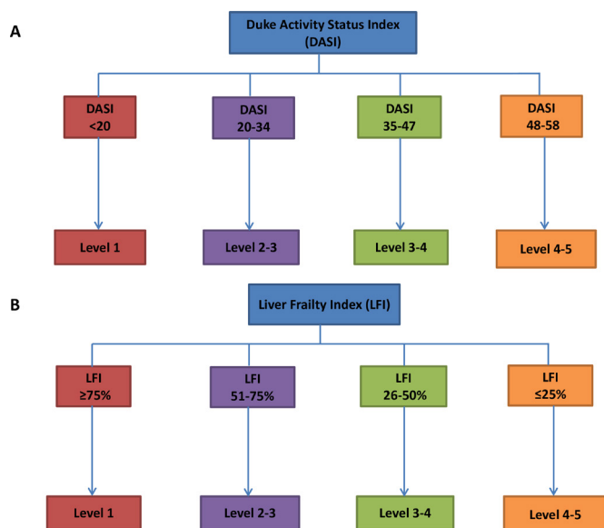
Figure 2 The programme and entry level of HBEP. (A) The initial level (duration, recovery period, intensity) of aerobic exercise sessions was determined from the baseline DASI. (B) The resistance exercise sessions will be developed according to the LFI.

Physio principles, the active role of the participant in the decision-making process, regarding progression and goal revision, will aim to support more autonomous reasons for engagement in the HBEP.